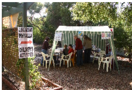
Advancing Whyalla's stall at the Mt Laura Homestead Museum open day.

Are you one of these people? Start thinking about how you could be affected now!