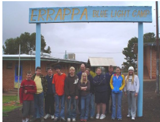
Previous Youth Camp Attendees after attempting the "Leap Of Faith" at Errappa Blue Light Camp in 2004.

If you know of any potential leaders aged 15 - 18 please nominate them at the Advancing Whyalla Office with their contact details.